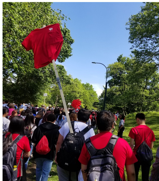
CPC at AIDS Walk New York 2017

For more information please call 646-613-8420 or email us at HIV@cpc-nyc.org . Hope to see you all there!