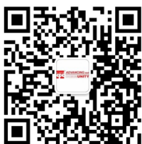
CPC WeChat QR Code

For more information and updates, please visit www.cpc-nyc.org